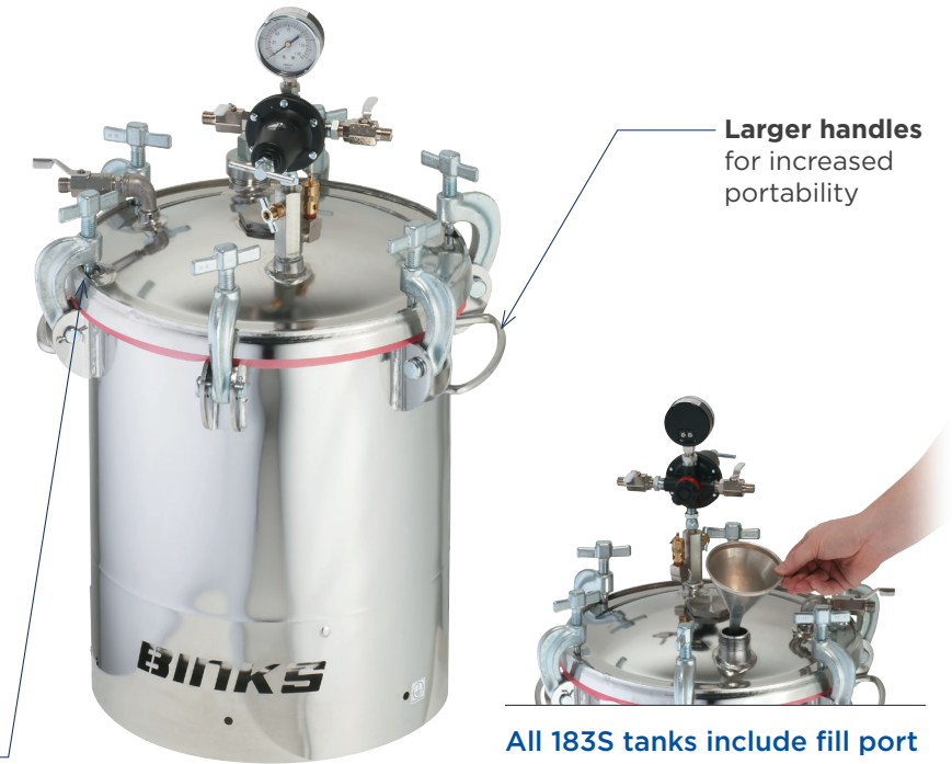
All 183S tanks include fill port